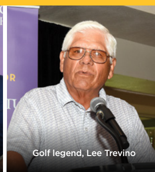
Golf legend, Lee Trevino