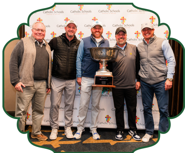
2023 Bishop's Cup Winners -St. Rita-

Please help us spread the word to others! We are always looking for day-of event volunteers as well. We humbly ask that you will keep us in your prayers as we work towards our fundraising goal of $725,000.